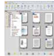
PaperPort SE 14

- The Professional Choice to Organize and Share Your Documents